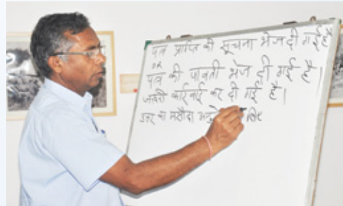
Hindi Workshop on 24 November 2014