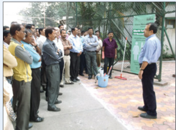
Swachh Bharat Mission