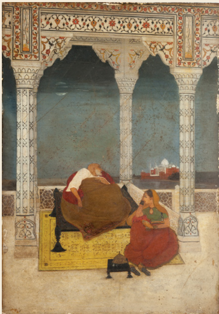
The Passing of Shah Jahan (1902), by Abanindranath Tagore; part of the exhibition in the Portrait Gallery of Victoria Memorial Hall from 3 March to 5 April 2015

Victoria Memorial Hall, 1, Queen's Way, Kolkata – 700071 Tel: 033 2223-1889 / 1890 / 1891 / 2962 / 2963 / 5142. Fax: 033 2223-5142 E-mail: victomem@gmail.com Website: www.victoriamemorial-cal.org You can also follow us on Facebook and Twitter