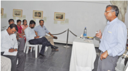
Hindi Workshop on 16 June 2014